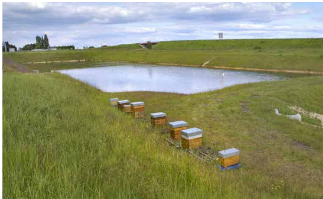
Biodiversity conservation: our beehives on the Domaine d'Harcourt rest and service area.

ALiS will work, in particular with local associations, on the conservation of freshwater ecosystems, the soil, natural environments and habitats in order to safeguard and protect biodiversity.